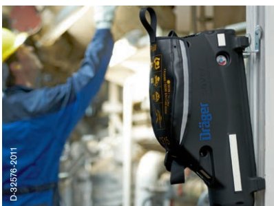
Dräger Saver CF hard case

Equipment Directive, the Pressure Equipment Directive and ISO 23269-1:2008 and ISO 23269-4:2011. Antistatic versions are also suitable for use in explosive atmospheres (ATEX zone 0).