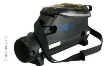
Dräger Saver CF – hard case