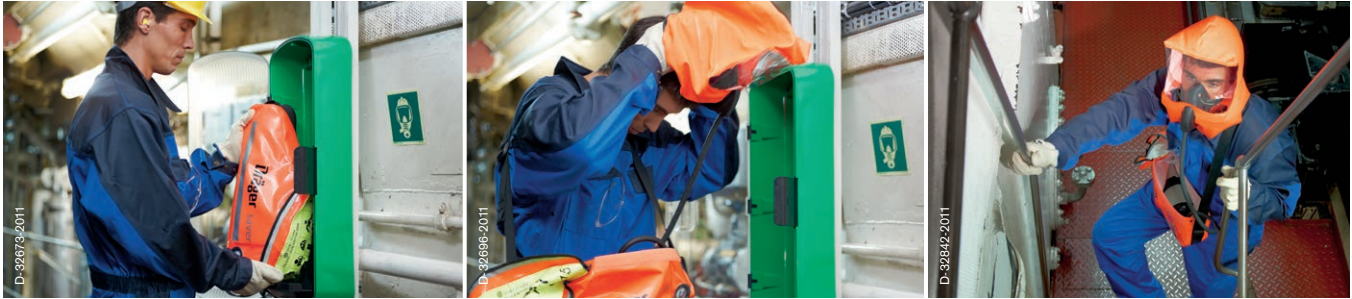
Dräger Saver CF soft bag