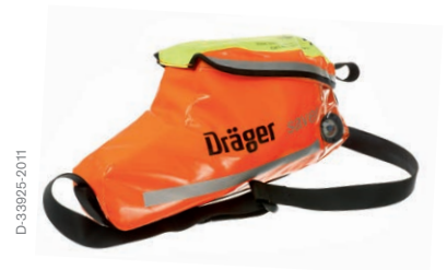
Dräger Saver CF – soft bag

The SE version includes a newly developed elastic neck seal which offers exceptional resistance to the effects of high temperatures, ozone and diesel fumes, which are often found in places such as engine rooms. Standard Dräger Saver CF15 units can also be retrofitted with the SE option. The Saver CF15 CC version utilises a carbon composite cylinder to meet the increasing demand for a lighter weight escape device. Available in the orange bag the Saver CF15 CC offers increased working flexibility with reduced wearer stress.